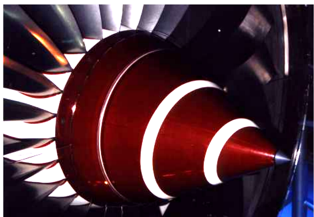
Engine nose cone coated with 2 component sealer plus EROS Elastomeric top coat.

Used as a sealer coat in composites in areas of varying surface finish, to seal resin weak areas, and provide a smooth, sealed surface for further priming and finishing. Available as a clear, or more typically green or black tint to aid application. Can be used with fast set up catalyst to provide fast curing and overcoating.