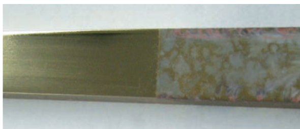
Coated and uncoated brass section after salt spray testing for 96 hours, illustrating protection provided by Incralac

Recent developments have included both air drying and stoving systems using the latest technology 'bright metal' pigments, producing coatings to replace bright nickel plating.