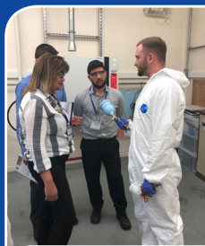
Product training in the Applications Facility