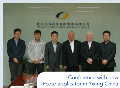
Conference with new Ipote applicator in Yixing China